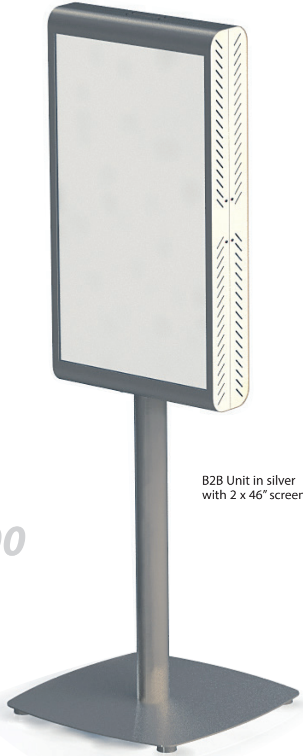
B2B Unit in silver with 2 x 46" screens

The unit is easy to assemble cutting down on installation time and cables can be routed under the base and through the column.