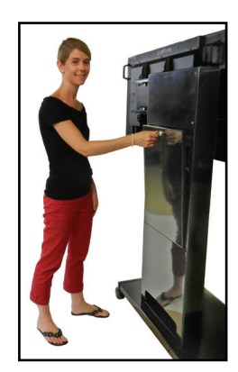
Drop down locking door allows easy access & provides neat appearance