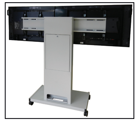
Simple to configure for single, twin or triple screens - edge to edge micro adjustment as standard for multi screens